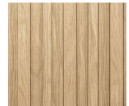
3 planks shades