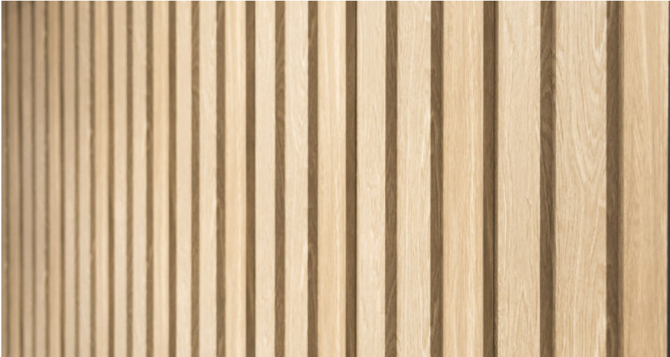
FLUTED PANEL 1.1

Prefinished Steel Wall Profile Without Visible Screws