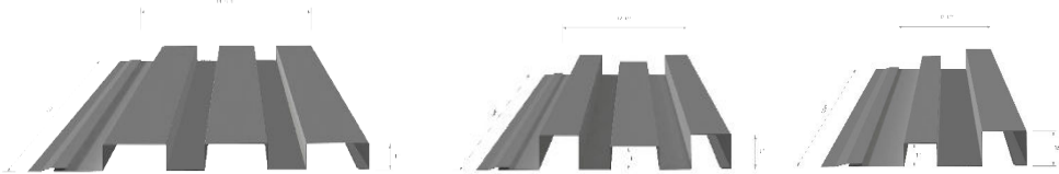
FLUTED PANEL 1.3